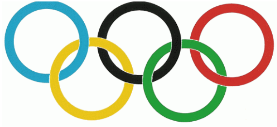
Shape No. 2 (Author, 2023)

In such a traditional society, there is a great correspondence and overlapping of the different spheres - identity is based on an apparent core and seems to be related to culturally determined values handed down from generation to generation. A "modern" society (first modernity, Ulrich Beck), on the other hand, can be characterized by the assumption that the different circles are much less overlapping, they form different spheres which have their own laws and logics - we can call this a kind of functional differentiation (Niklas Luhmann) and it could be characterized either by the interaction and different functions of the organs of a body or by the Olympic rings.